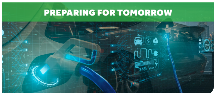
PREPARING FOR TOMORROW