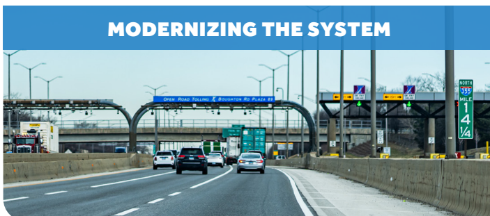
MODERNIZING THE SYSTEM