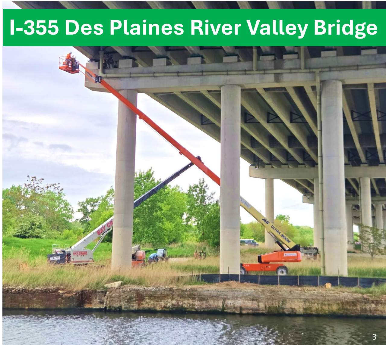
I-355 Des Plaines River Valley Bridge