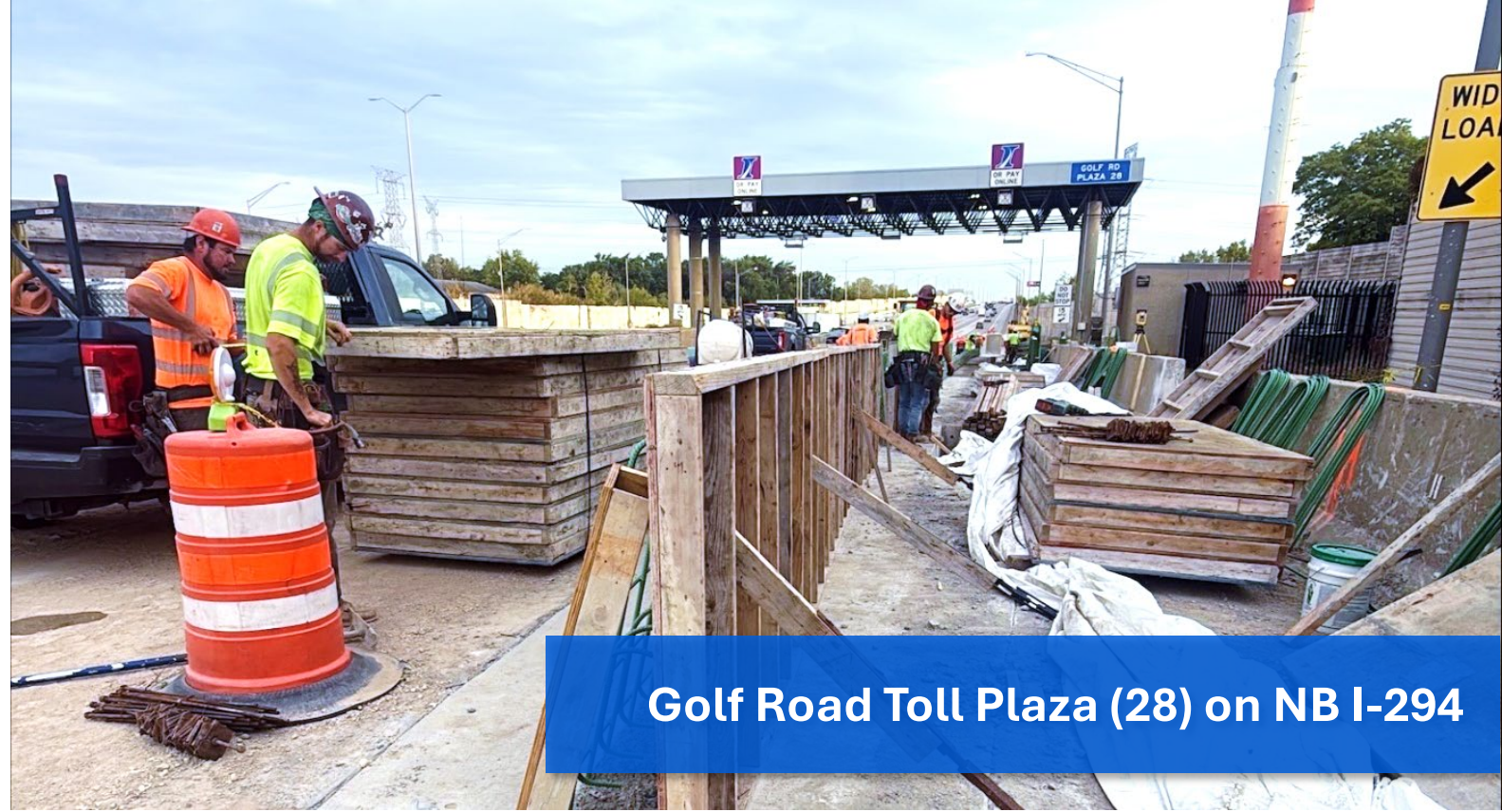
Golf Road Toll Plaza (28) on NB I-294