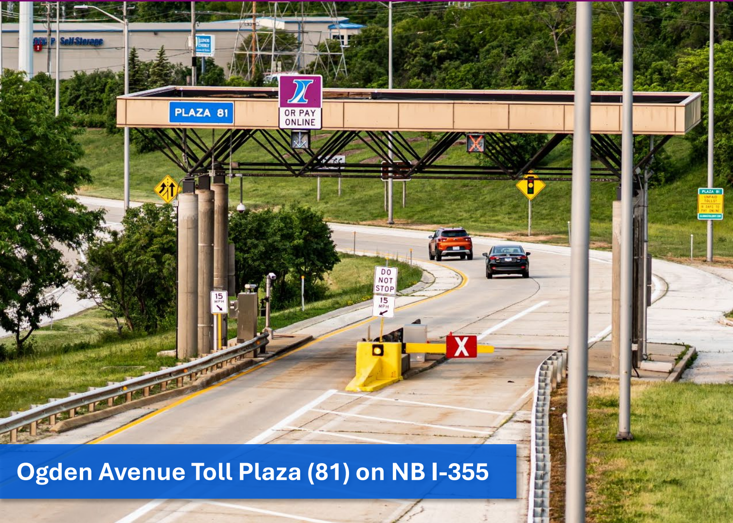
Ogden Avenue Toll Plaza (81) on NB I-355