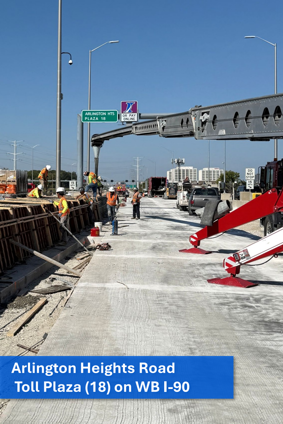
Arlington Heights Road Toll Plaza (18) on WB I-90