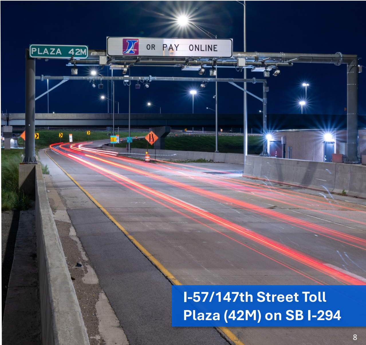
I-57/147th Street Toll Plaza (42M) on SB I-294