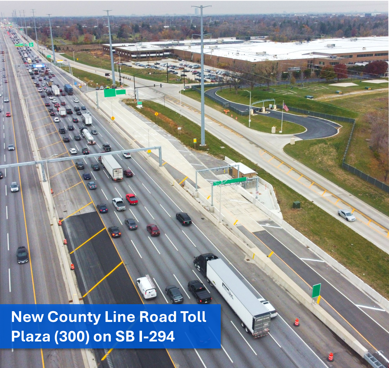
New County Line Road Toll Plaza (300) on SB I-294