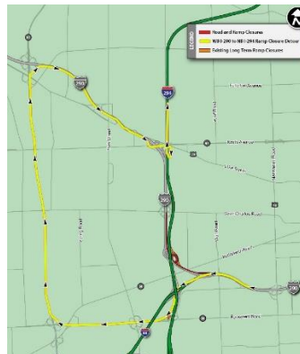
WB I-290 to NB I-294 Ramp Closure Detour View Map