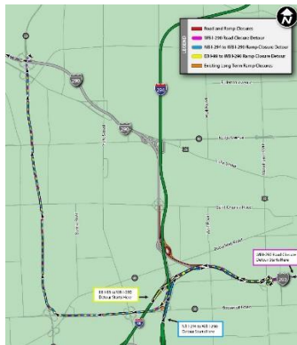
WB I-290 Road and Ramp Closure Detours View Map

In addition, as part of ongoing construction in the area, the ramp connecting westbound I-290 to northbound I-294 currently has a long-term closure and detour in place routing traffic from westbound I-290 to Lake Street. During the overnight closures on westbound I-290, traffic will be routed to westbound I-88 and then to westbound Roosevelt Road, northbound Illinois Route 83/Kingery Highway, eastbound I-290 and eastbound Lake Street to access northbound I-294.