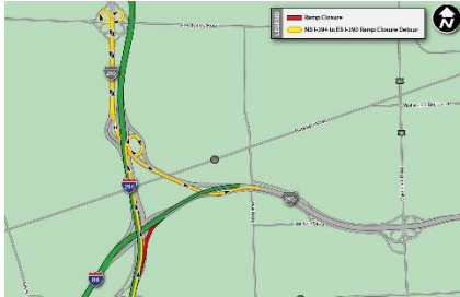
NB I-294 to EB I-290 Detour