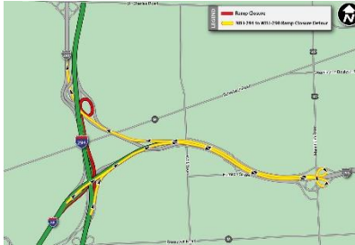
NB I-294 to WB I-290 Detour