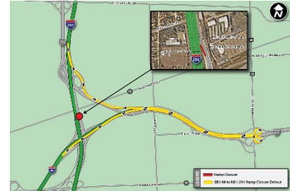
EB I-88 to NB I-294 Detour